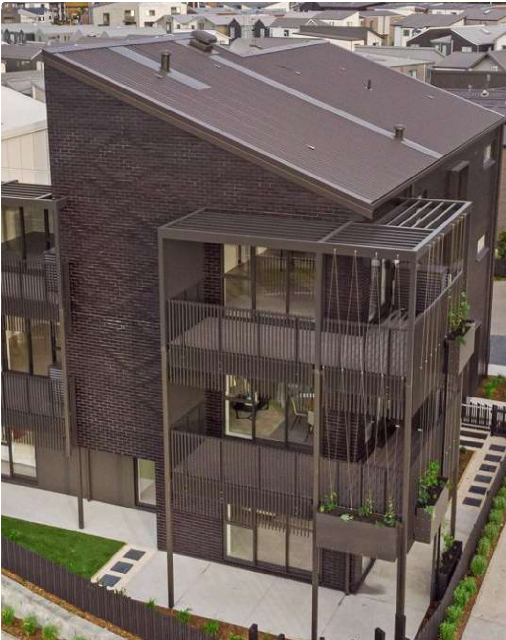
Project: Hobsonville TU4 Architect: Construkt Architects Builder: Fletcher Living

Aurae planter boxes enable you to integrate plants into your project's façade. Use our bracket systems to fix the planters to the building and use aluminium grating, stainless steel cable or fixed vertical fins to promote plant growth.